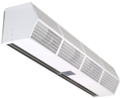
SANITATION CERTIFIED HIGH PERFORMANCE 7

Quikserv air curtains are designed to produce a quiet, yet high volume and high velocity stream of air to help guard your building from insects, fumes, dust, odors, and other contaminants when used over service doors and all other building openings. The units are ideal for interior installations and come with a white casing to suit any application.