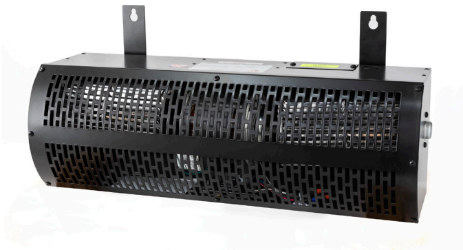
HEATED AIR CURTAIN